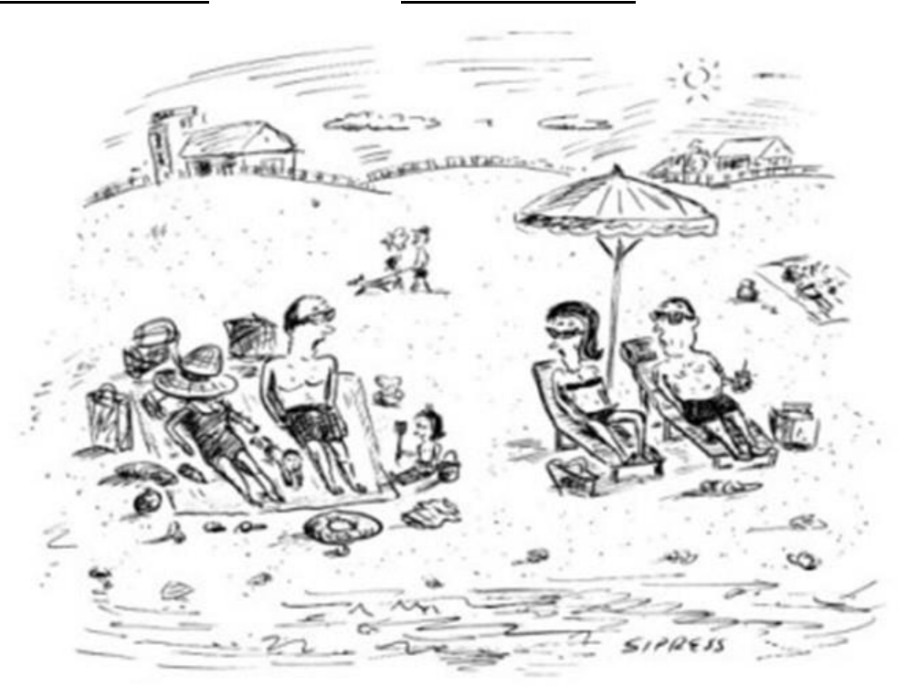
"We're not year-round people, weekend people, or summer people. We're last-ten-days-in-August people."

We have unique and sophisticated investment methods that seek to capture the stock market's gains while minimizing drawdowns in bear markets. If you would like to learn more about how we manage money, we invite you to give us a call at (415) 249-6337 , visit www.deltaim.com or email us at info@deltaim.com.