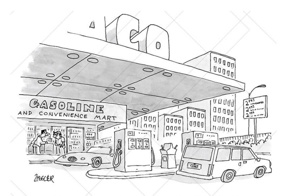
"The good news is that a delicious stick of jerky is still a very affordable seventy-five cents."

We have unique and sophisticated investment methods that seek to capture the stock market's gains while minimizing drawdowns in bear markets. If you would like to learn more about how we manage money, we invite you to give us a call at (415) 249-6337 , visit <a href="mailto:www.deltaim.com">www.deltaim.com</a> or email us at <a href="mailto:info@deltaim.com">info@deltaim.com</a>.