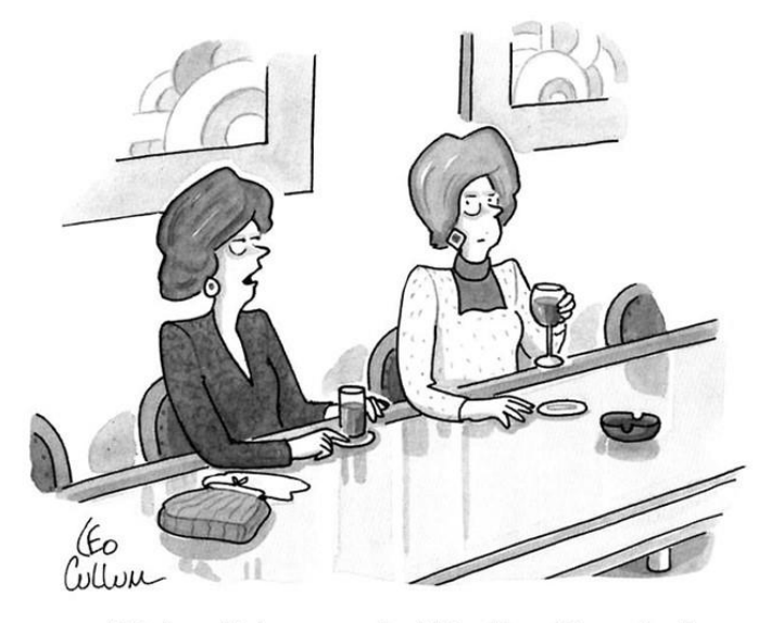
"Herbert thinks women should be allowed in combat."