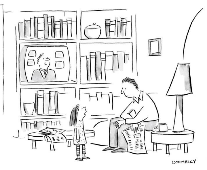
"Daddy, can I stop being worried now?"

We have unique and sophisticated investment methods that seek to capture the stock market's gains while minimizing drawdowns in bear markets. If you would like to learn more about how we manage money, we invite you to give us a call at (415) 249-6337 , visit <u>www.deltaim.com</u> or email us at <u>info@deltaim.com</u>.