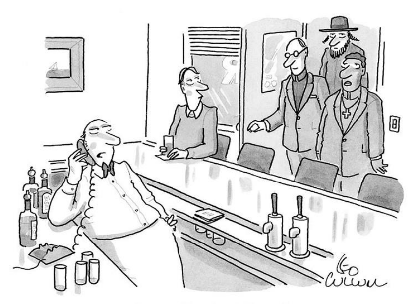
"Stop me if you heard this one."