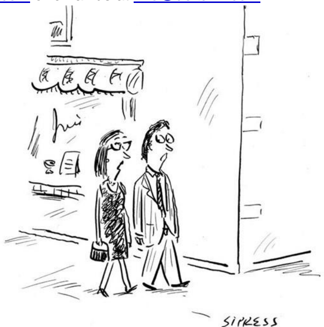
"My desire to be well-informed is currently at odds with my desire to remain sane."

We have unique and sophisticated investment methods that seek to capture the stock market's gains while minimizing drawdowns in bear markets. If you would like to learn more about how we manage money, we invite you to give us a call at (415) 249-6337 , visit <a href="mailto:www.deltaim.com">www.deltaim.com</a> or email us at <a href="mailto:info@deltaim.com">info@deltaim.com</a>.